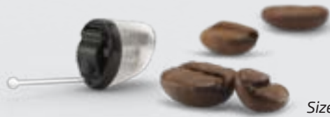
Size comparison with coffee beans.

In order to achieve optimal comfort, Oticon Intiga i is custom fitted to your ear. As it is placed inside the ear, Oticon Intiga i captures sound in the same way your ears were designed to. Based on Oticon's premium technology, Oticon Intiga i gently preserves and amplifies sounds so what you hear is always clear - whether you are listening to voices or music.